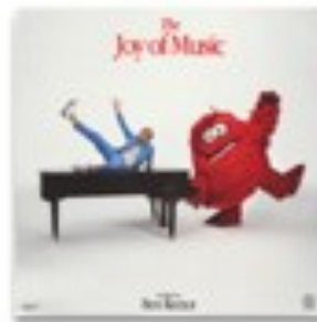
Thank You Ben Rector